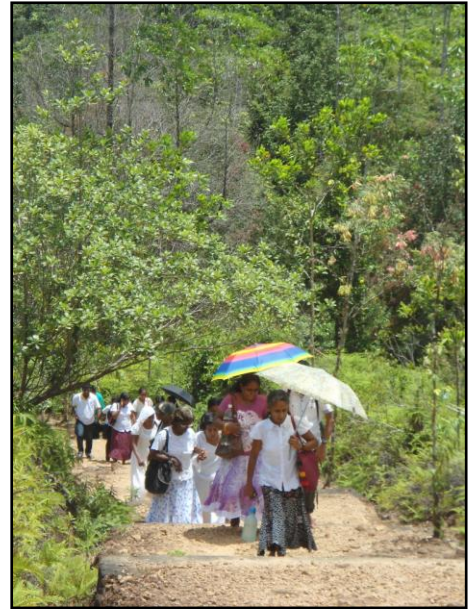
The journey back from Kottawa Rain Forest.