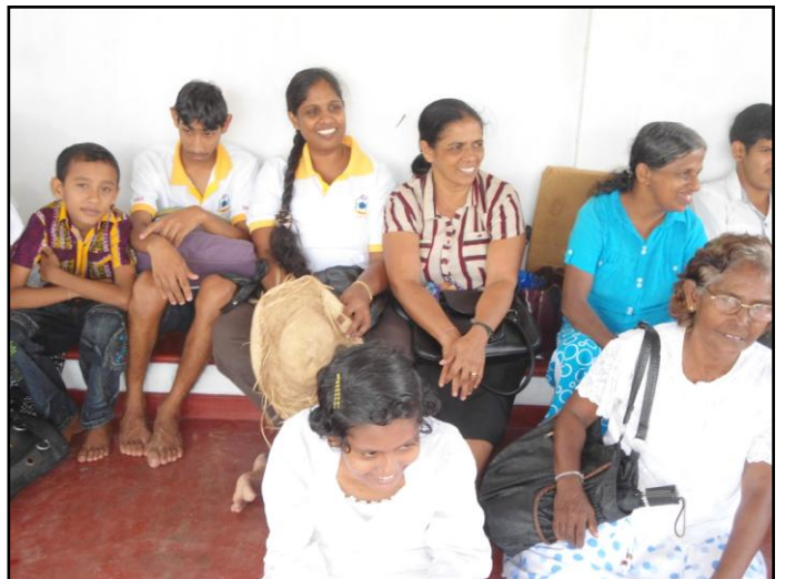
Visiting Kottawa Rain Forest.