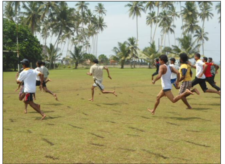
Collecting coloured flags!