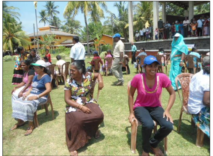
Passing the ball according to the music!