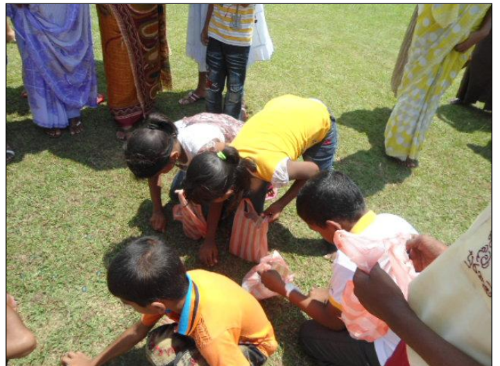
Putting the eye on the elephant!