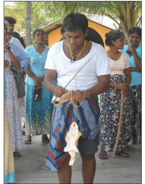
New Year princess contest