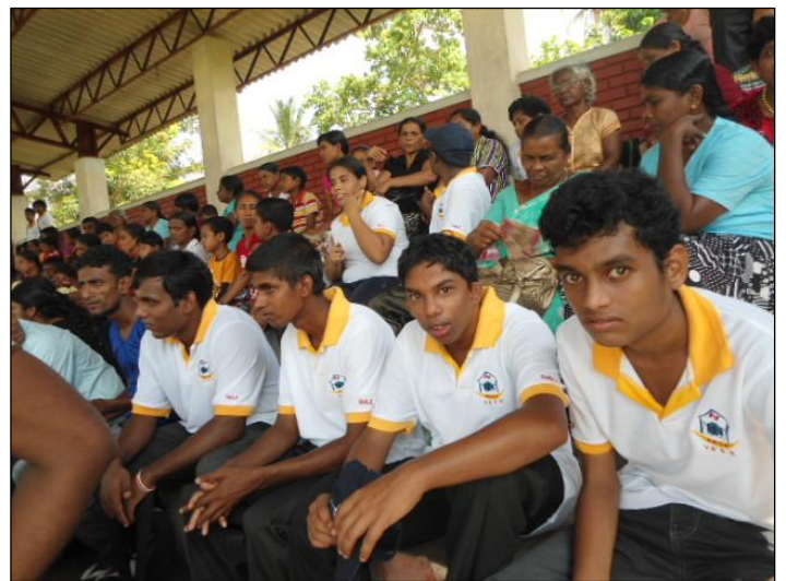
After the opening ceremony new year games were divided into three year groups.